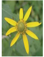
Cut-leaf Coneflower P, L