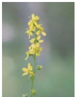
Agrimony P, L