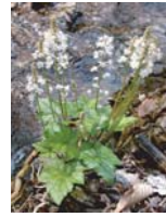
Foamflower P, R