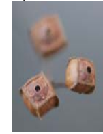
Seedbox fruits F, W