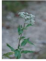
Late- flowering Thoroughwort F