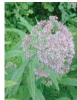
Joe Pye Weed F