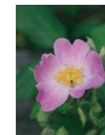
Wild Rose F