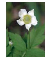
Thimbleweed P, L