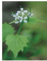
Garlic Mustard Invasive Non-native L