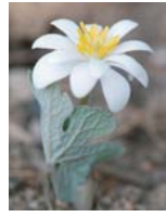
Bloodroot P, R