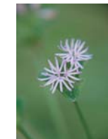
Devil's Grandmother P, L