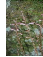
Beechdrops P, L