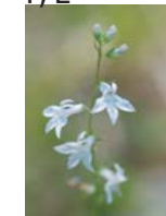
Pale Spike Lobelia C