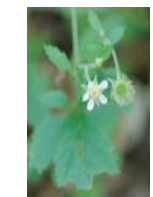
White Avens P, L