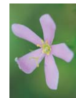
Rose Pink F, C