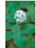
White Milkweed P, L