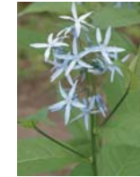
Blue Star; Blue Dogbane P