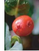
Partridge- berry P, L