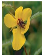
Partridge Pea F