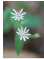
Star Chickweed P, R