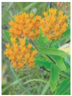
Butterfly- weed C, F