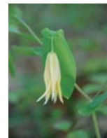
Perfoliate Bellwort P, L