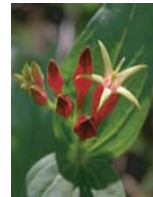
Indian Pink P, L