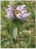
Heal-all P, L