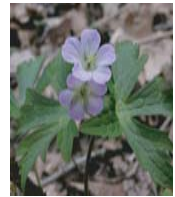
Wild Geranium P, L