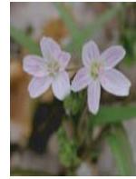
Virginia Spring Beauty P, L