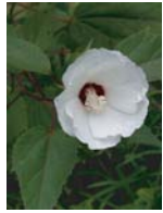
Rose Mallow W