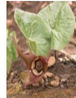
Wild Ginger P, L