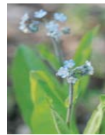
Wild Comfrey P, L