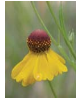
Purple-headed Sneezeweed F, W