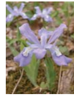
Dwarf Crested Iris P, L