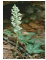
Rattlesnake Orchid P, L