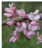
Redbud F (edges)