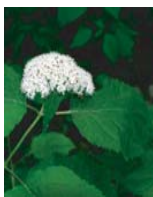
Wild Hydrangia P, L