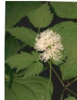
White Baneberry (Doll's Eyes) R