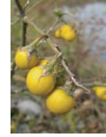
Horsenettle berries F