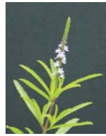
Vervain C, F