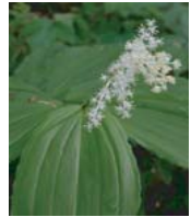
False Solomon's Seal P, R