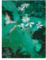
Wood Aster P, L