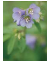
Greek Valerian P