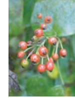
Rose hips F, L

The Haw Ridge Greenway is a multi-purpose recreational area located on Edgemoor Road in Oak Ridge, TN. It has 20 miles of trails of varied terrain open for mountain biking, horseback riding, and hiking. Please enjoy the wildflowers in their natural setting. Do not pick or dig the plants.