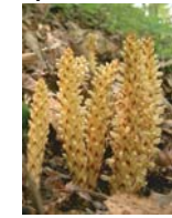
Squawroot P, L