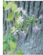
Late Purple Aster P, L