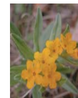
Hoary Puccoon C