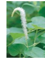
Lizard Tail W