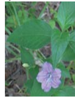
Ruellia; Wild Petunia P, L