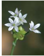
Wild Garlic P, L