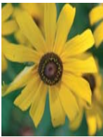
Black-eyed Susan F