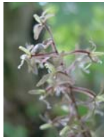
Cranefly Orchid P, L