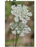
Queen Anne's Lace F