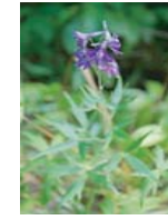
Tall Larkspur P, C