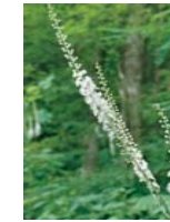
Black Cohosh P, L