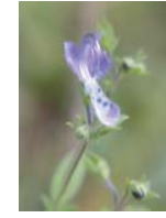
Blue Curls F