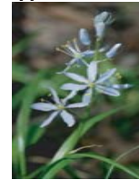
Wild Hyacinth P