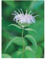
Bee Balm C