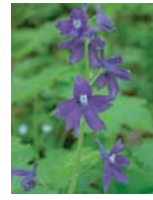
Dwarf Larkspur P