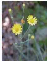
Grass-leaved Golden Aster F (edges)