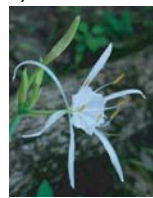
Spider Lily P