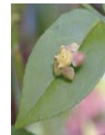
Hearts-a-Bustin' P, R, L