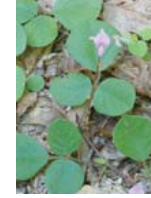
Prostrate Tick Trefoil P, L