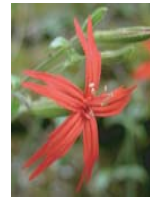
Fire Pink P, L