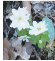
Rue Anemone P, R