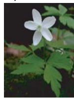
Wood Anemone P, L