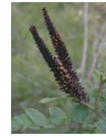
Indigo Bush W