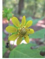
Bear Paw F (edges)