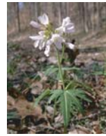
Cut-leaf Toothwort P, L