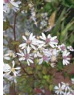
Calico Aster F (edges)