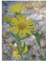
Golden Prairie Aster F (edges)