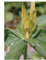
Lemon Trillium P, L