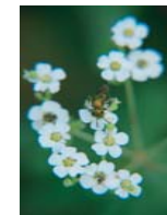
Flowering Spurge P, C