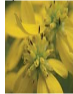
Golden Crownbeard F