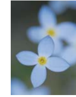
Bluets P, R, L