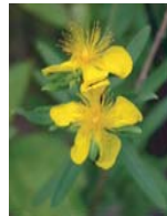
St. Johnswort C