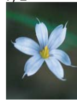
Blue-eyed Grass C