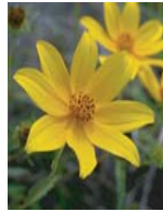
Ozark Stickseed F (edges)